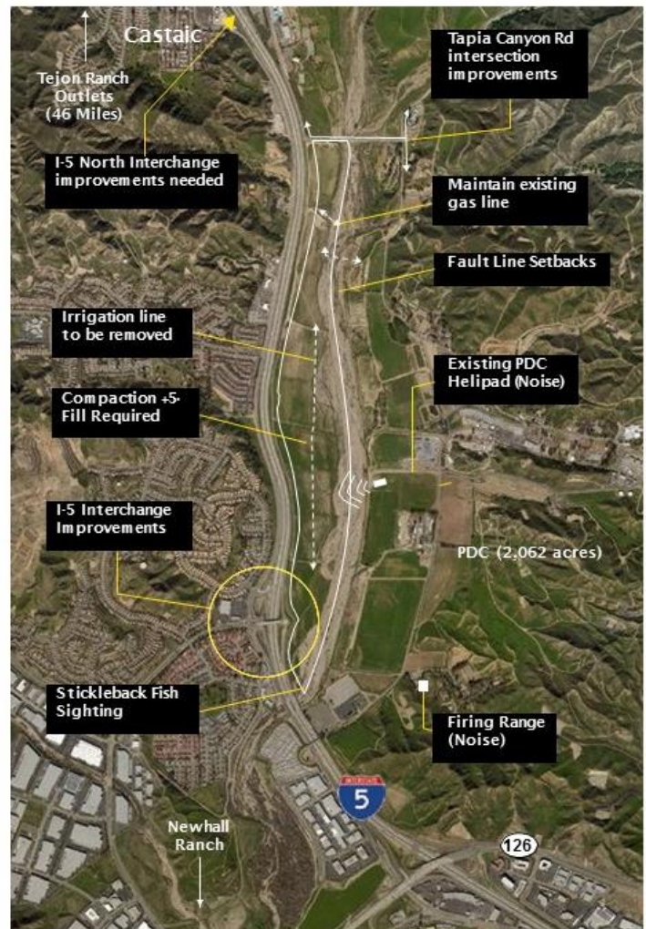
Summary of Honor Ranch Opportunities and Constraints

The diversity of land uses surrounding Honor Ranch present both benefits and challenges for development. Nearby commercial and light industrial developments such as the Valencia Commerce Center and Southern California Innovation Park help create an existing concentration of high-salary sectors, offering increased opportunity for synergistic relationships between Honor Ranch and surrounding uses. However, other nearby land uses may create noise issues for Honor Ranch, particularly those associated with an existing PDC firing range, and traffic from the I-5. Additionally, the site's proximity to the PDC and associated perceptions concerning safety may need to be addressed.